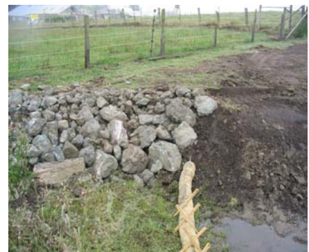
Gully Repaired—Banks revegetated and rocked 2005