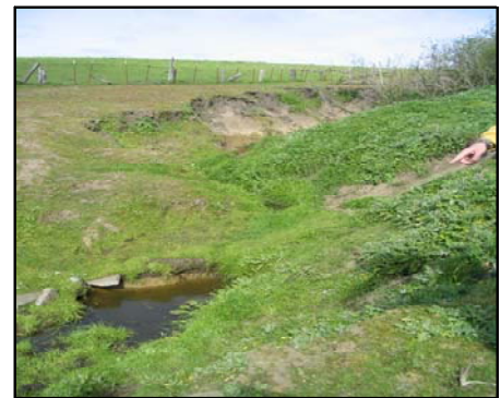
Upland Pasture Gully—2004