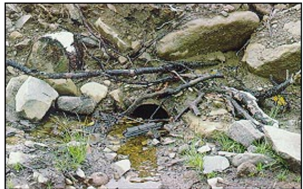
Undersized culverts can become plugged with sediment and debris.

"When we see land as a community to which we belong, we may begin to use it with love and respect."