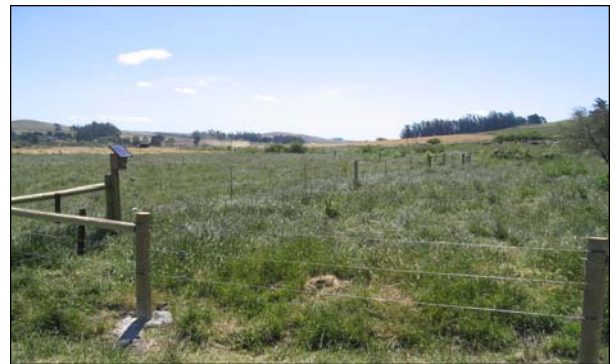
Ranch Fencing Installed—2005

With grant money from the California State Coastal Conservancy and the State Water Resources Control Board, the RCD has been able to assist ranchers in the Estero Americano with the implementation of erosion control projects. Projects include gully repair, the installation of ranch fencing, streambank revegetation, road upgrades, and the development of off channel watering for livestock.