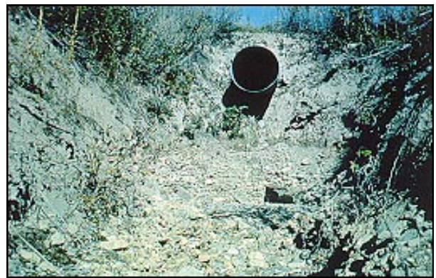
A culvert not installed at the existing stream gradient can degrade the channel.

Call 823-4662 or goldrge@sonic.net to schedule a preliminary site visit.