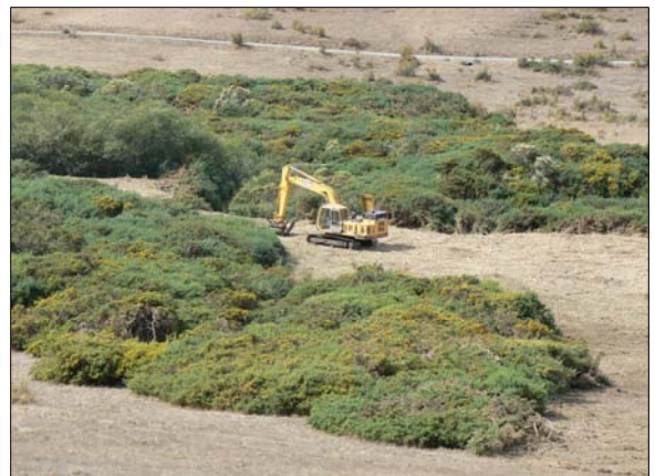
Above: Masticator grinding through a thicket of Gorse in the Estero Americano